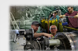
OIB to Skill Bridge