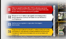
Multifunctional Logistics NCO