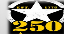
Army Sustainer 250