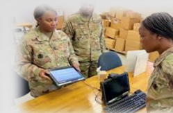
Streamline Property Accountability